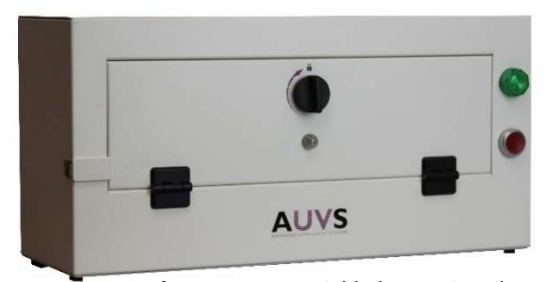
The UV Box - Quickly becoming the healthcare standard in non-chemical disinfection of mobile handheld devices.